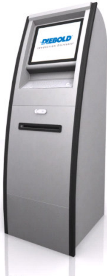
A free-standing, dedicated terminal for web banking, inquiry transactions and more

A revolutionary free-standing kiosk...So many features, such a small footprint